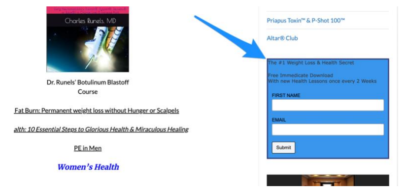
Figure 2. Example of an opt-in form (you should have one).

This brings up two ideas about emails, which is still the best way to market (email). They're long-form. Well, other than being very good at what you do, that's the best way to market. But people don't know you're good at what you do unless some of their friends find you. Email works the best. It's called an opt-in form, and some of my people have done this part where you have a form that offers something for free in exchange for a first name and an email address. Then, emails that you've already written can come automatically. Here's an example of an opt-in form (found at Runels.com):