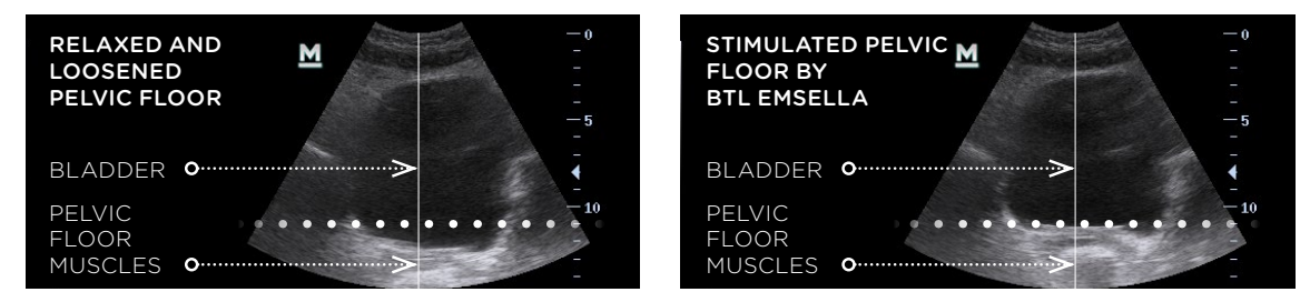
Figure 4: A frontal view of the pelvic floor muscles and bladder using medical ultrasound. Relaxed and loosened pelvic floor muscles and bladder (left). Stimulated and lifted pelvic floor muscles and bladder using HIFEM technology (right).

PFM, stimulation, and relaxation of the PFM. Repetition of these phases and focused electromagnetic energy delivery leads to pelvic floor muscle stimulation, adaptation, and remodelation.